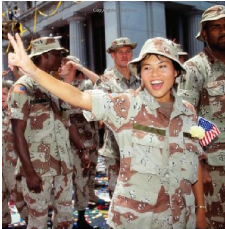
Volume 2: From 1865

DOC | *audiobook | ebooks | Download PDF | ePub